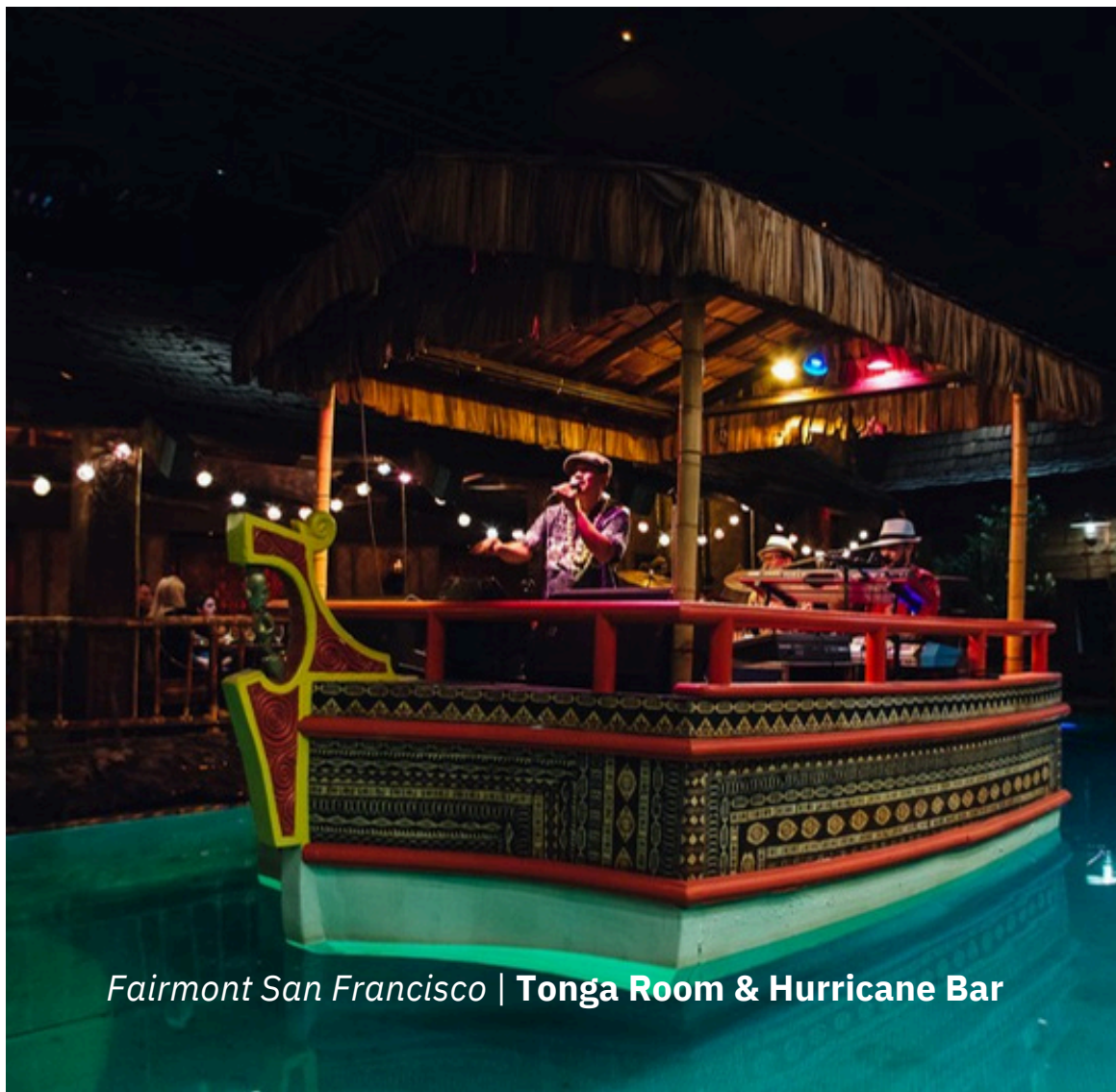
Fairmont San Francisco | Tonga Room & Hurricane Bar

Events held in the Tonga Room & Hurricane Bar can accommodate up to 450 guests with various buyout options and layouts.